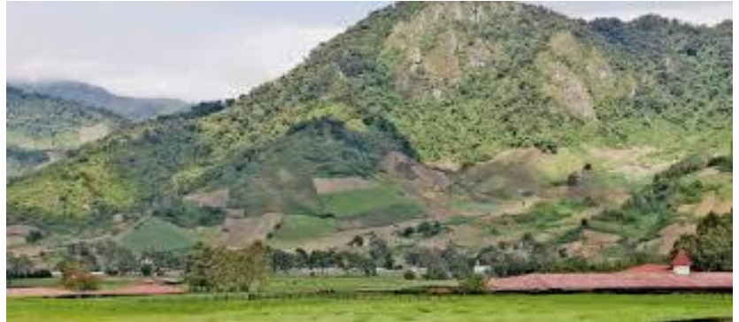
Panama, referred to as the "bridge of life," separated 2 oceans and joined North and South America nearly 3 million years ago, resulting in the biodiversity found there today. Smaller than South Carolina, Panama hosts more species of birds and trees than all of North America.

Students will learn about the importance Panama has had on the biological corridor between North and South America and the steps being taken to help preserve its species and unique environment while visiting a tropical research center, participating in a field research activity with a Smithsonian scientist, and exploring the Biomuseo and wildlife at the Metropolitan National Park.