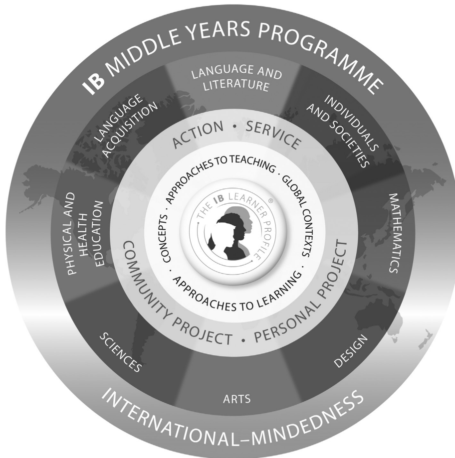
Figure 1 Middle Years Programme Model

The MYP is designed for students aged 11 to 16. It provides a framework of learning that encourages students to become creative, critical and reflective thinkers. The MYP emphasizes intellectual challenge, encouraging students to make connections between their studies in traditional subjects and the real world. It fosters the development of skills for communication, intercultural understanding and global engagement—essential qualities for young people who are becoming global leaders.