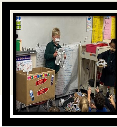
Kinder and first are winning with CIS-PTA project!