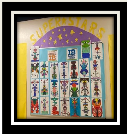
Who we are 5 th grade!